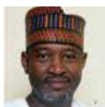
H.E. Sirika Hadi Minister of State for Aviation Republic of Nigeria