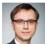
H.E. Volodymyr Omelyan Ministry of Infrastructure Ukraine