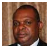
H.E. Didier Dogley Minister of Tourism, Civil Aviation, Ports and Marine, Republic of Seychelles