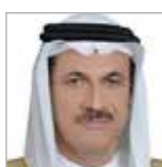
H.E. Sultan bin Saeed Al Mansouri Minister of Economy and Chairman General Civil Aviation Authority