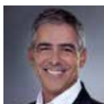
Pedro Neves United Nations Leader of Task Force for Public – Private Partnerships

10:00AM - 11:00AM Unlocking Debt, Equity Funds or PPP'S