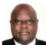
Hon. Aggrey Henry Bagiire Minister of State for Transport Republic of Uganda

Moderator: Dr. Fethi Chebil, PPP Airport Expert