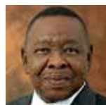
H.E. Blade Nzimande Minister of Transport Republic of South Africa